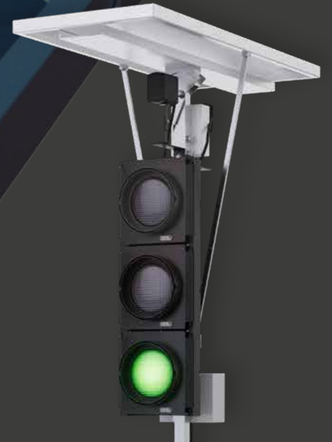
Asset Battery Voltage TM290

Maintenance is incredibly low thanks to the efficient solar system - an occasional panel clean is all that's needed to keep SolarLight™ operating at peak performance. Removing leaves and dirt, where possible, helps to improve the efficiency of the panels.