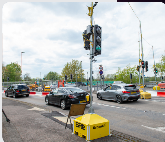
Above: Urban64 onsite on Rose Kiln Lane, Reading.